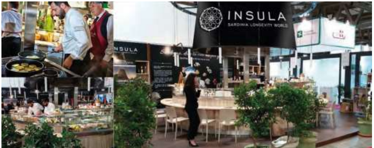
PHOTO GALLERY FOOD & WINE CORNER INSULA (TUTTO FOOD 2017 -CIBUS 2018- SIAL 2018)

The quality of our agro-food products is coupled with the longevity of the Sardinians to promote the Sardinian variant of the Mediterranean diet. More healthier. More taste. Longevity is a great emotional attribute with a unique attraction for your customers.